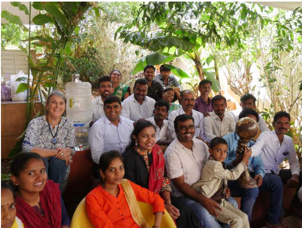
SOME OF OUR DEDICATED TEAM

Our audit report is available on line at our website on https://srdindia.org . All potential donors or existing donors are welcome to inspect our accounts when required. SRDS maintains a transparent and fully open system available to all who need to reassure themselves that our dealings are fully above board and legal.